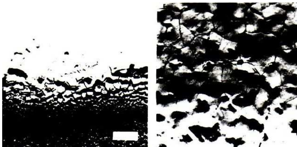
Fig. 2. The damaged titanium surface caused by the laser radiation of the energy density per pulse of:

this region maximal temperature was near the melting temperature, although the laser beam intensity was only 40% of the peak value (see Figs. 1a and b).