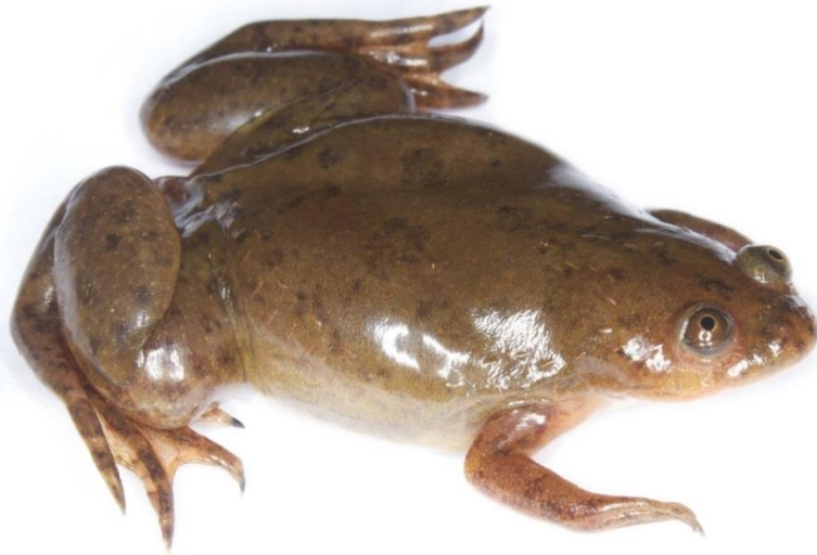
Figure 1. Xenopus laevis (flickr.com)