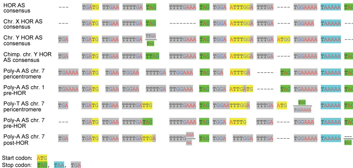
Figure 3. Specific composition of start/stop CLTs in alpha satellite monomers from HOR and monomeric sequences in human chromosomes and in chimpanzee Y chromosome. Chromosomes without specifications of species are human, while chimpanzee chromosome is denoted as chimp. AS denotes alpha satellite.

Shannon construction of trinucleotide frequencies alpha satellite HORs is found here, they do not exhibit any periodic structure to sides of the central motif (Supplementary figure 2). Here an alternative model of wrap-